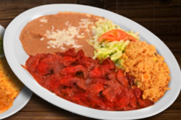
Lomo de Res en Chile de Árbol 18 99 Chopped rib eye in spicy chile de arbol sauce, rice and beans