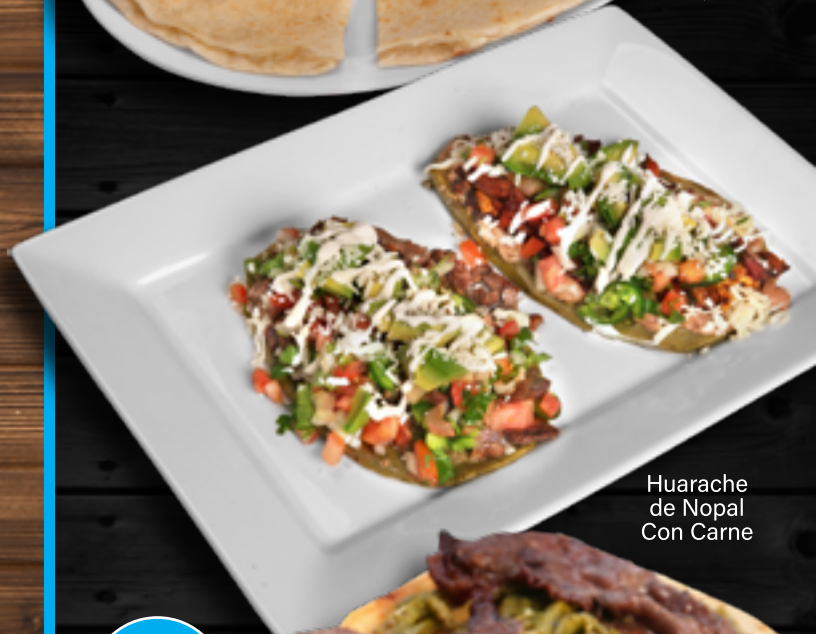
Huarache de Nopal Con Carne