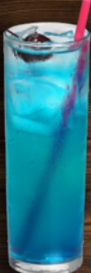
Blue M.F. 13 House tequila, rum, vodka, lime juice, blue curacao, lime juice