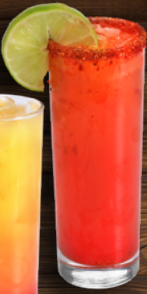
Vampiro 9 House tequila, sangrita Viuda de Sanchez and Squirt