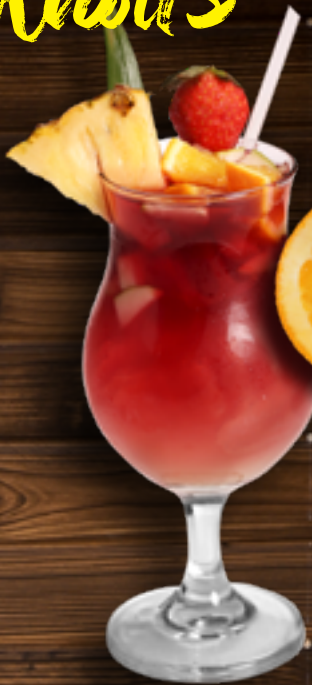
Red or White Sangria 11 Brandy, red or white wine, citrus juice, chopped fruit