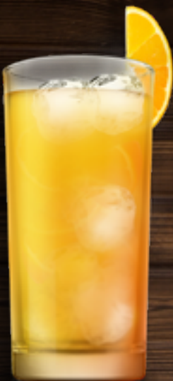
Screwdriver 10 Vodka, grenadine, orange juice