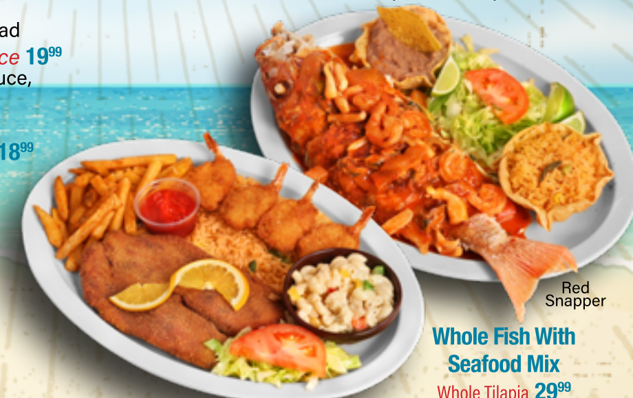
Breaded fish fillet with breaded shrimp 22 99