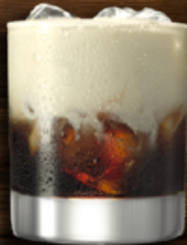
White Russian 13 Tito's vodka, coffee liqueur and half & half cream