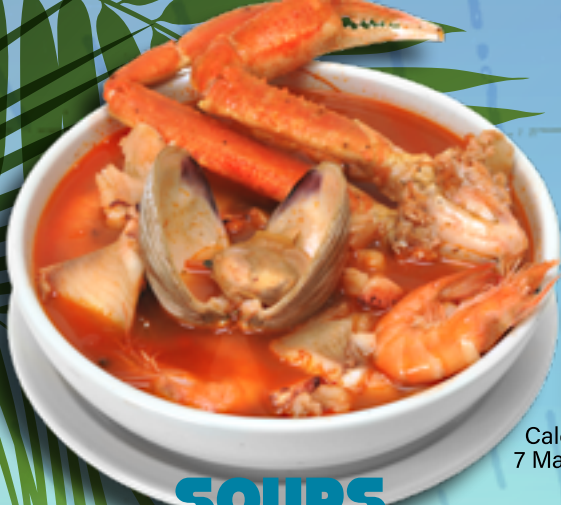
Caldo 7 Mares