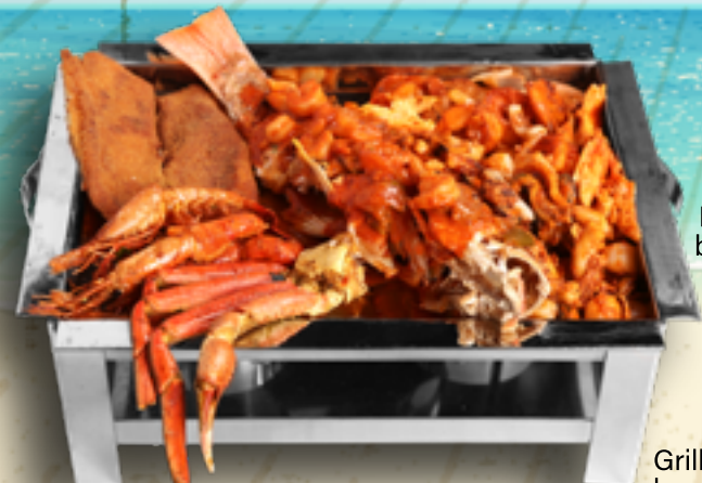
Parrillada de Mariscos Sm