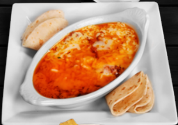
Queso Fundido Con Chorizo