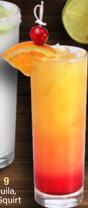
Tequila Sunrise 9 House tequila, grenadine, and orange juice