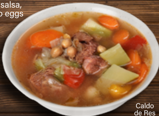
Caldo de Res