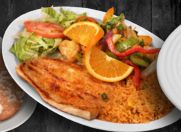
Pechuga a La Plancha 17 99 Grilled chicken breast served with steamed vegetables, salad and rice