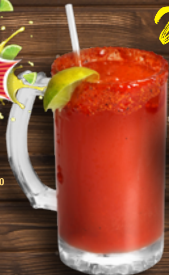
Michelada Regular 8 House spicy mix, clamato, lime juice, assorted spices and sauces. Made with your favorite beer