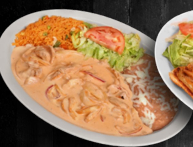
Pollo a la Crema 17 99 Chicken breast in a creamy sauce