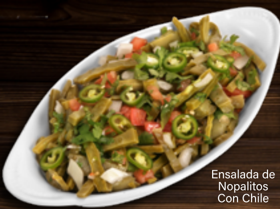
Ensalada de Nopalitos Con Chile