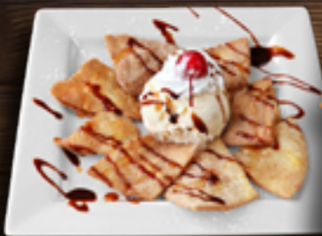
Sopapillas Con Helado