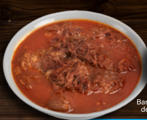
Barbacoa de Res