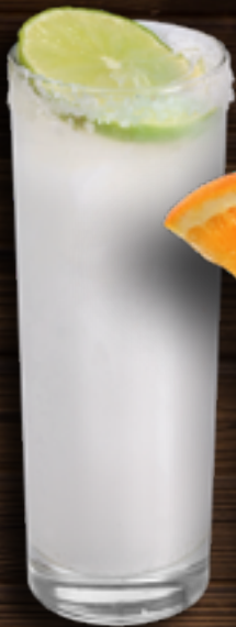
Paloma 9 House tequila, lime juice, Squirt