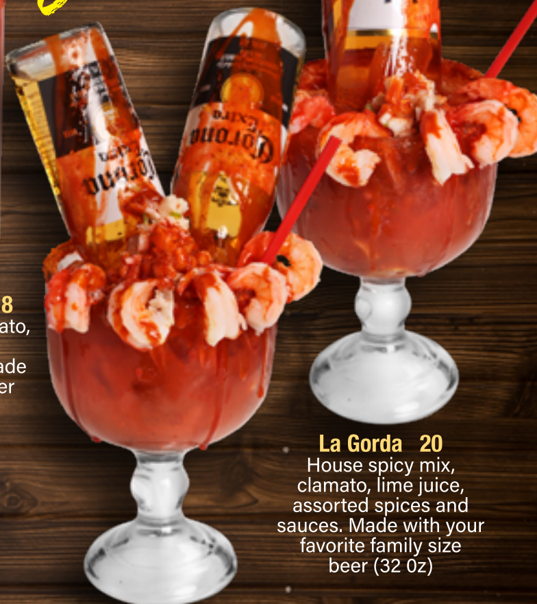
La Gorda 20 House spicy mix, clamato, lime juice, assorted spices and sauces. Made with your favorite family size beer (32 Oz)