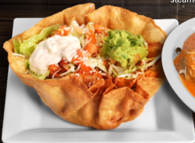
Taco Salad 14 99 Crispy flour tortilla shell with beans, lettuce, tomato, guacamole sour cream, cheese and your choice of meat: shredded chicken, grilled chicken $2 extra, steak $2 extra, ground beef, pastor (marinated pork)