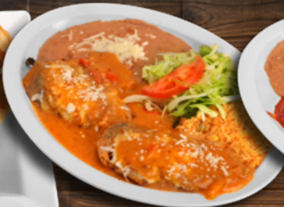
Chiles Rellenos A La Diabla 18 99 Two poblano peppers stuffed with cheese topped with spicy sauce, rice and beans