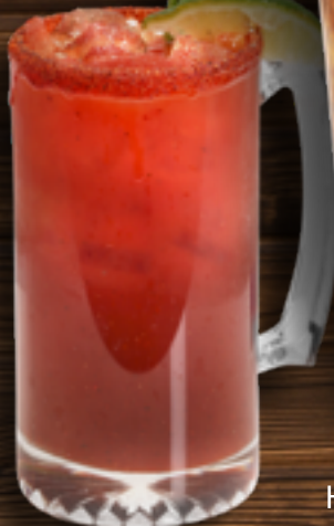
Bloody Mary 9 Vodka, clamato juice, lime juice and assorted sauces and spices