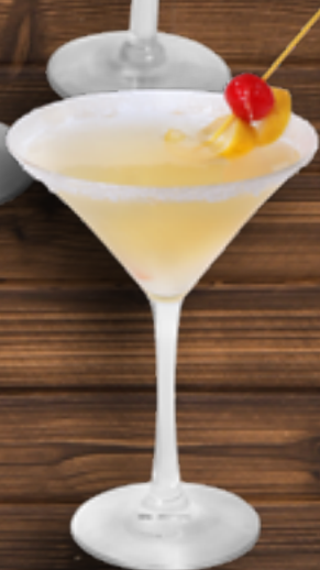
Lemon Drop 13 Vodka, triple sec, lemon juice