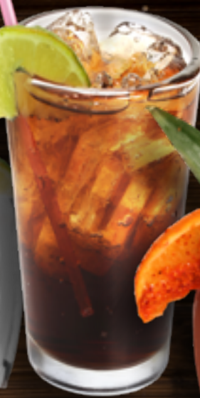
Charro Negro 9 House tequila, lime juice, Coca-Cola