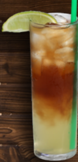
Long Island Iced Tea 13 Tequila, rum, vodka, lime juice, splash of Coke