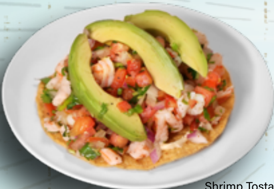
Shrimp Tostada (Served cold)