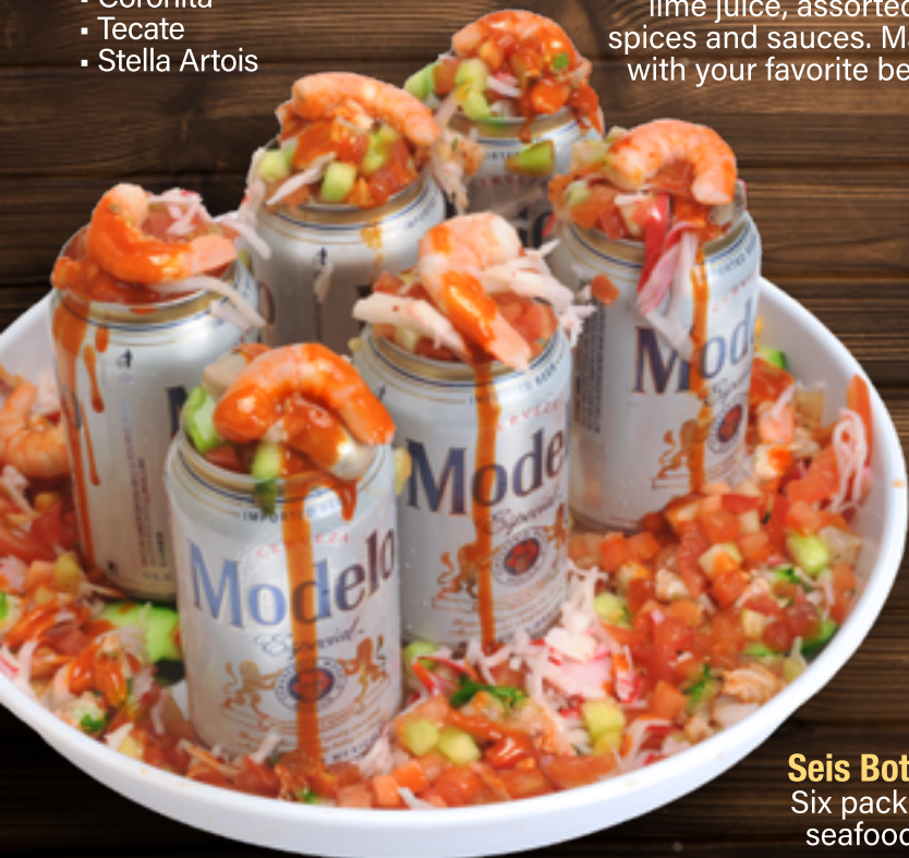
Seis Botanero 40 Six pack beer with seafood ceviche