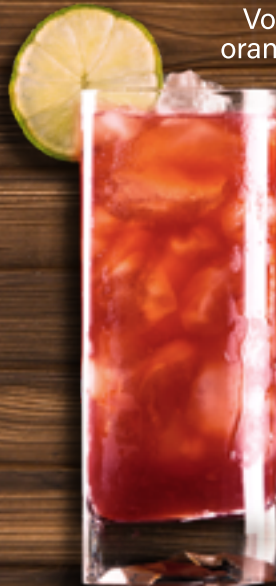
Mai-Tai 11 Rum, pineapple and orange juices, grenadine