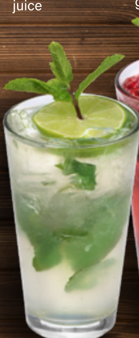
Mojito 13 White rum, seltzer water, lime juice, fresh spearmint leaves. FLAVORS: • Lime • Mango • Colada • Strawberry • Raspberry