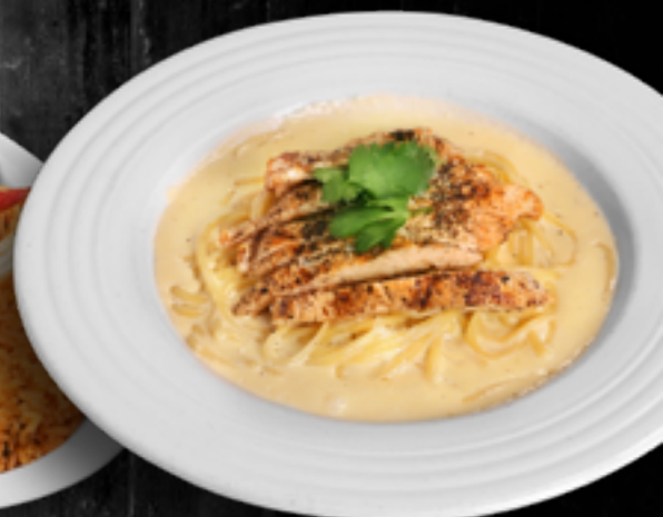
Alfredo Pasta Chicken 18 99 Shrimp 20 99 Chicken, Sausage & Jalapeño 20 99